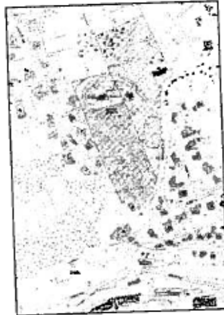
Gibbs Hill Lighthouse - Additional Parkland