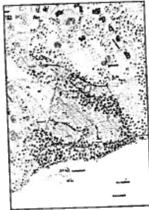
Abbot's Cliff Park