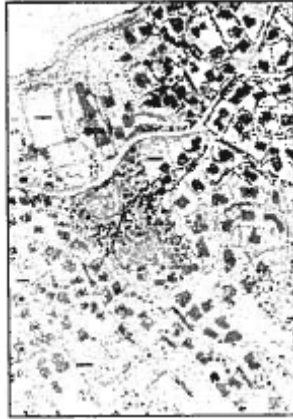
Abbot's Cliff Park