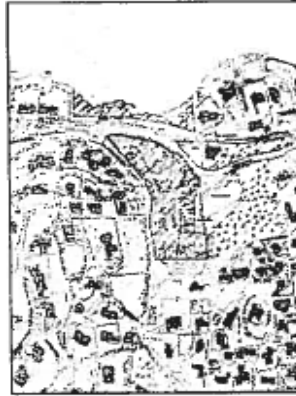
Barnes Corner Park